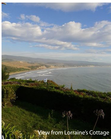
View from Lorraine's Cottage

I found with some good planning and finding some great accommodation that allows dogs you can have a stress free holiday that you and your beloved dogs can enjoy. Oh and don't forget to check out when you are on holiday to a new area what Agility show is on – always good to compete at another club and get different ribbons!