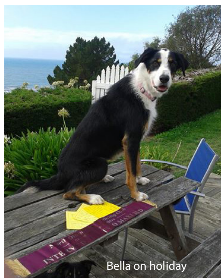
Bella on holiday